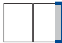
1/3 Page V