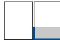
1/3 Page H