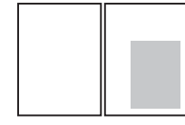
1/2 Page Island No Bleed 4.875" x 6.875" Bleed not available