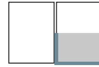
1/2 Page H No Bleed 7.5" x 4.625" Bleed 9" x 5.375" Live Area 8" x 4.875"