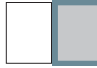
Full Page No Bleed 7.5" x 9.875" Bleed 9" x 11.375" Live Area 8" x 10.375"