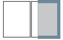
2/3 Page V No Bleed 4.875" x 9.875" Bleed 5.625" x 11.375" Live Area 5.125" x 10.375"